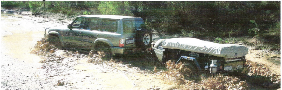
Leading the Way into Adventure with a Challenge Camper from Campers on the RUN

Also available for hire - jerry cans for fuel and water, camp tables & chairs, camp beds, bunks, fridges etc.